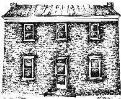
BLAND COUNTY JAIL ESTABLISHED 1866

Mailing Address: PO Box 416 Bland, VA 24315 Email: info@blandcountyhistsoc.org