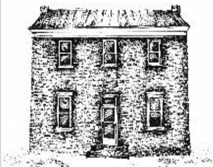
BLAND COUNTY JAIL ESTABLISHED 1866

Mailing Address: PO Box 416 Bland, VA 24315 Email: info@blandcountyhistsoc.org