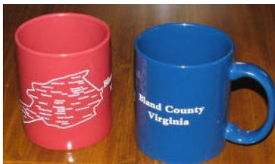
Bland County Cups

We have a list of all items with pictures, descriptions and prices on our website.